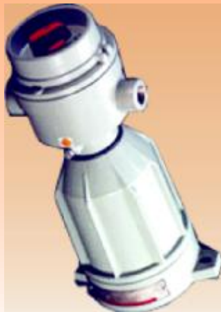
FLP/WP VESSEL LAMP FITTINGS