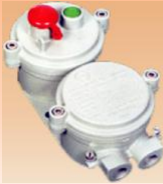
FLP/WP PUSH BUTTON STATION