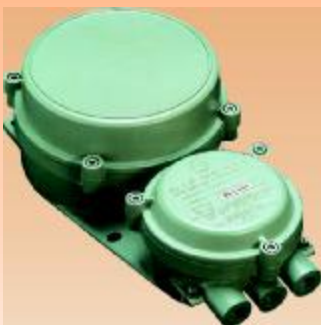
FLP/WP CONTROL GEAR BOX