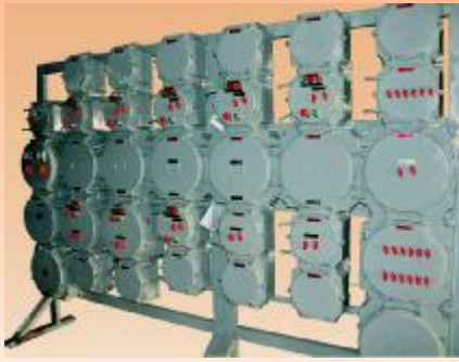
FLP/WP PANEL BOARD