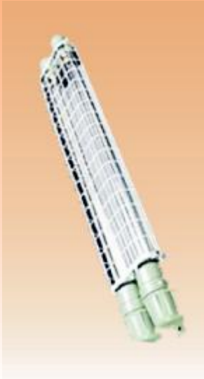
FLP/WP FLOURESCENT FIXTURES