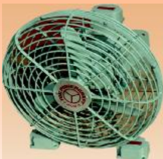
FLP/WP WALL FAN