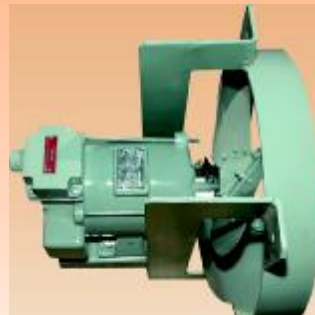
FLP/WP EXHAUST FAN