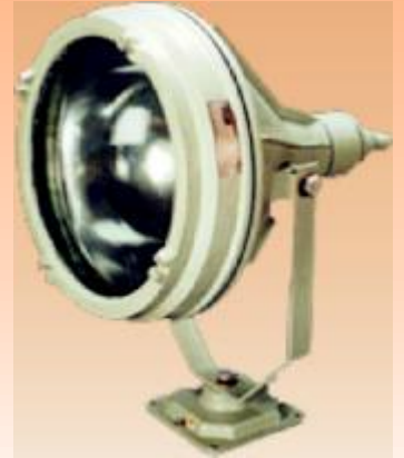
FLP/WP FLOOD LIGHT FITTINGS