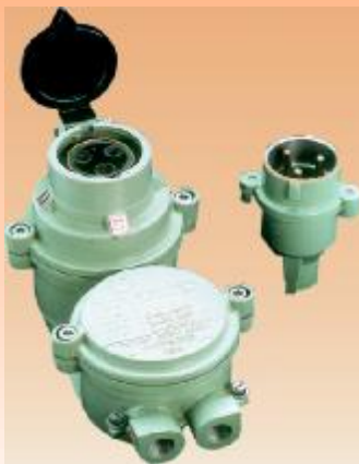
FLP/WP SWITCH SOCKET & PLUG