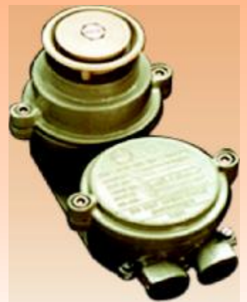
FLP/WP ELECTRONIC HOOTER