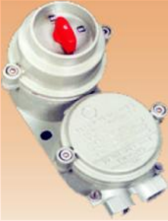
FLP/WP ROTARY SWITCH