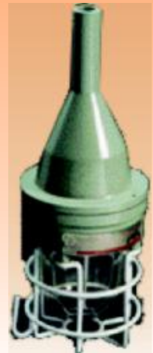
FLP/WP HAND LAMP FITTINGS