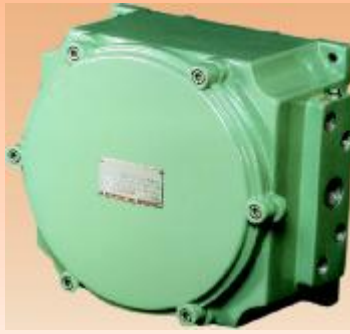
FLP/WP MULTIWAY JUNCTION BOX