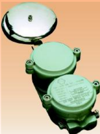
FLP/WP GONG BELL