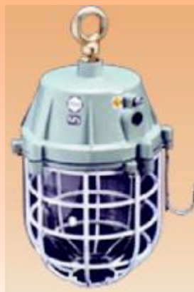
Ex - nR WELL GLASS FITTINGS