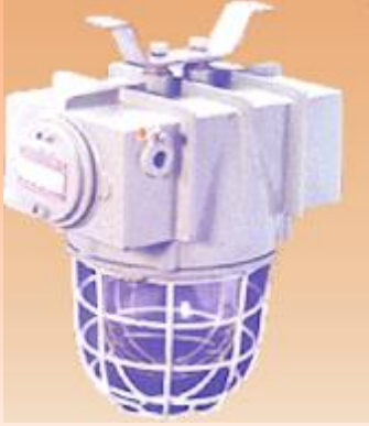
FLP/WP INTEGRAL WELL GLASS FITTINGS