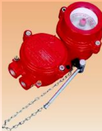
FLP/WP MANUAL CALL POINT