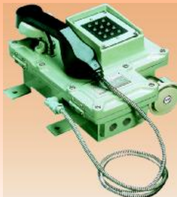
Ex - i & Ex - d TELEPHONE