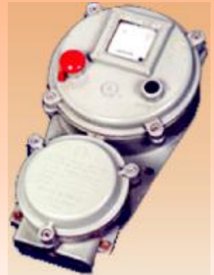
FLP/WP PUSH BUTTON & AMMETER