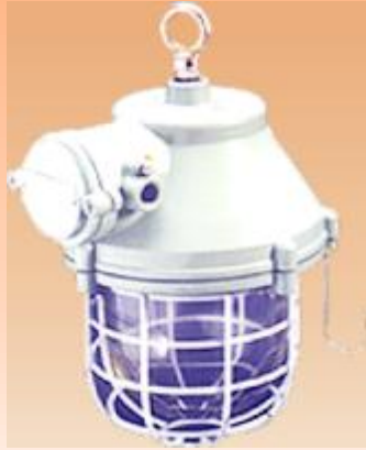
FLP/WP WELL GLASS FITTINGS